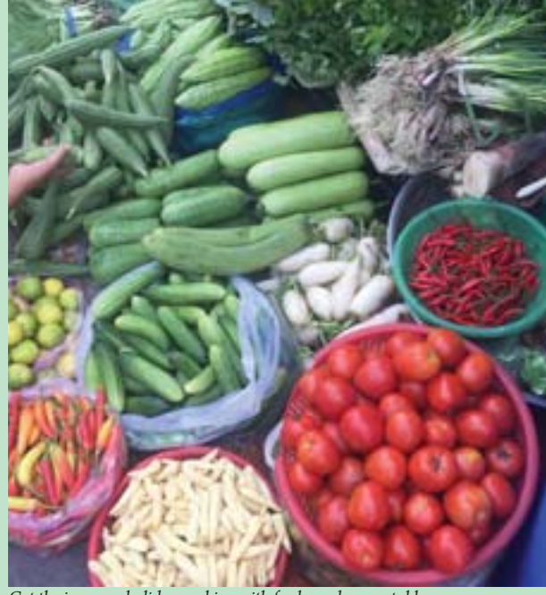
Get the jump on holiday cooking with fresh garden vegetables.