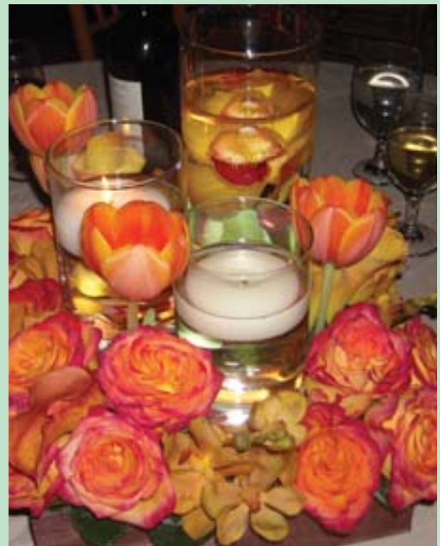
Deck the halls with a simple composition of roses and orchids on a table centered by a candle.