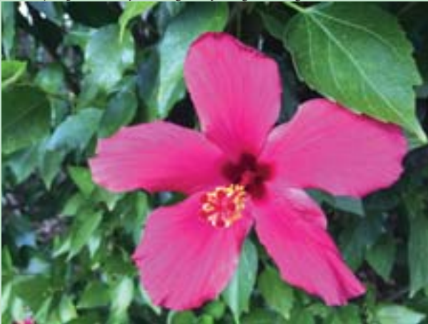
As winter nears a bright pink hibiscus offers tropical delight.