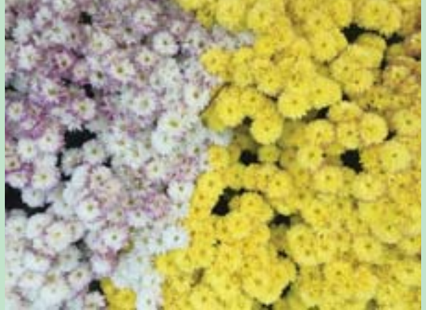
Growing tightly together, these colorful mums are happy bedmates.